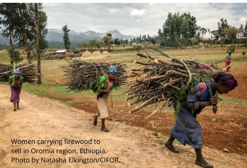
Women carrying firewood to sell in Oromia region, Ethiopia.

continuing experience of land dispossession, the Batwa of Rwanda survive largely by scavenging or selling their labor in exchange for food items. Many Indigenous peoples in East Africa live in hard-to-reach places, where food, support, information and emergency relief take a long time to reach. Border closings, movement restrictions and other lockdown measures have exacerbated poverty and food insecurity for these communities, hurting the livelihoods of transboundary pastoralists, hunter-gatherers and other semi-nomadic and nomadic communities. 23 These measures have also impeded goods and services from leaving or entering Indigenous communities, complicating the effects of recent violent cattle rustling activities, internal conflicts, crop and livestock losses, severe locust infestation, low yields and severe floods experienced throughout East Africa. 24 Because women and girls in some Indigenous societies eat last and least when food is scarce, there is the possibility that COVID-19 will specifically expand existing risks for compromised nutrition and associated morbidities among Indigenous women. 25