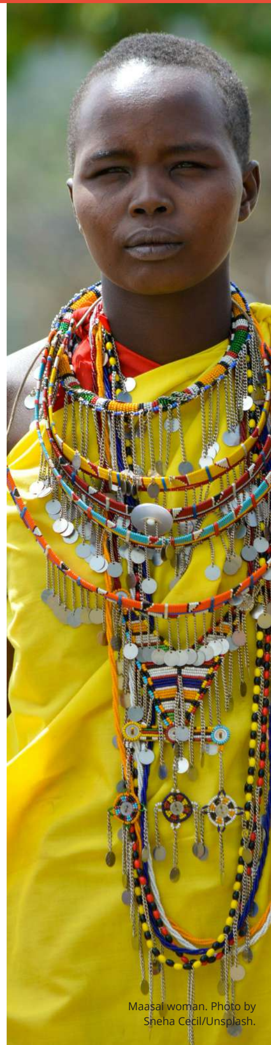
Maasai woman.